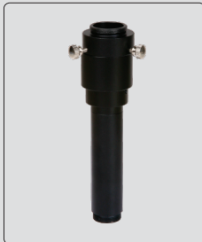
Camera interface (optional)