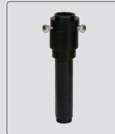
Camera interface (optional)