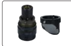
lens with half-reflection mirror