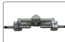
swivel center support