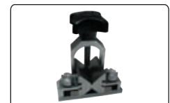
V-block with clamp