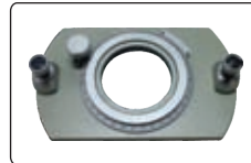
rotary table (glass diameter 100mm, graduation 2°)